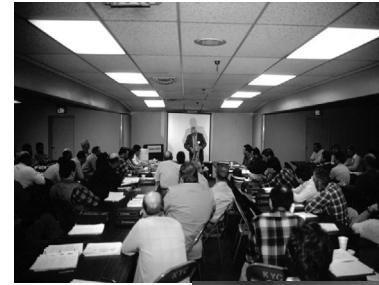
1988, first Crop Management Workshops. Presentation (left) and hands-on (below). Richmond, IN